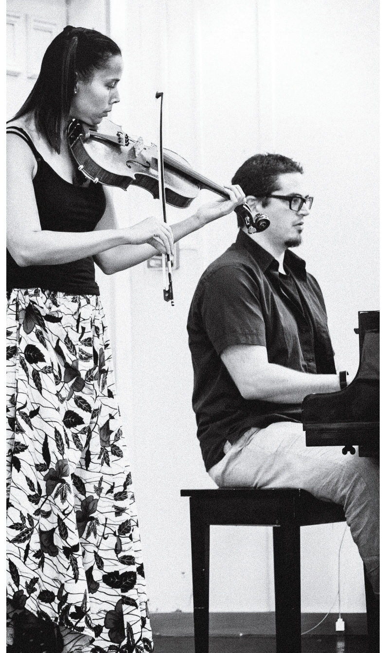
Rhiannon Giddens, Francesco Turrisi